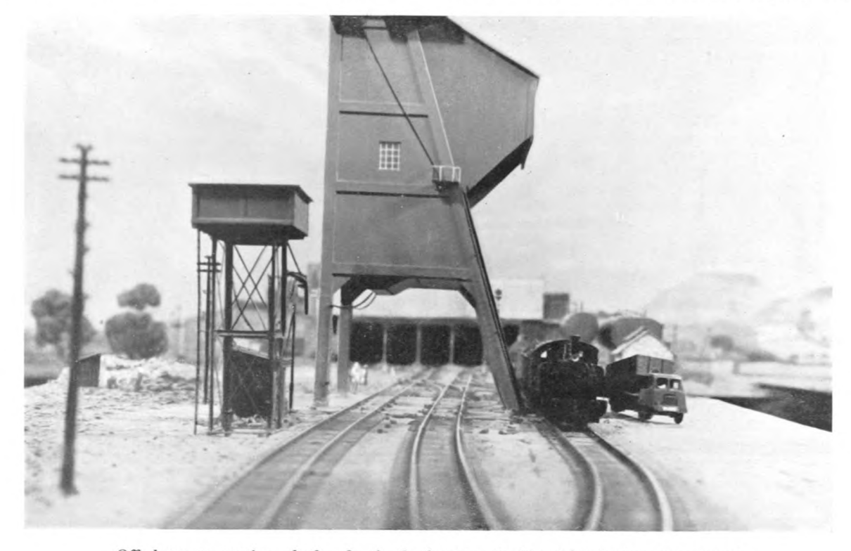
Off loop to engine shed. 0-4-0 shunter (colliery) bringing up empties.

And what of O gauge then? In my opinion, so far as indoor operation is concerned, it is a gauge for the constructor, because the running effect is far away from realism. Gauge O is the kind of gauge which permits of detail for a photograph. The lines will not lend themselves to realism, neither in operation nor appearance, unless a vast area is available. So far as operation and running is concerned, together with